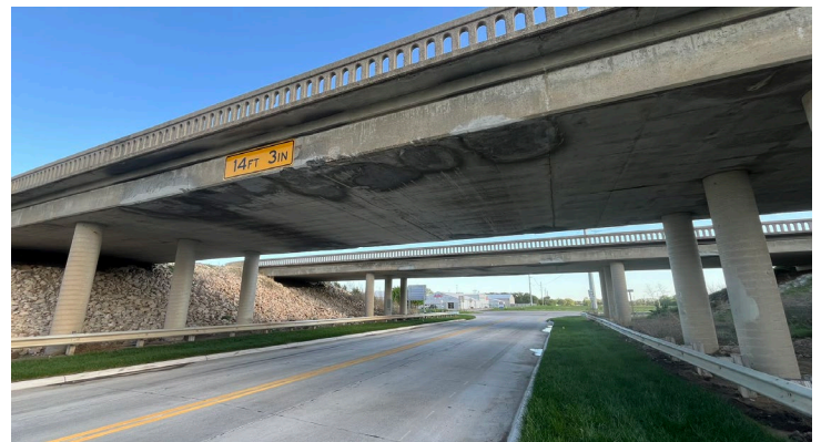
The U.S. 24 Bridges over Goodyear Road