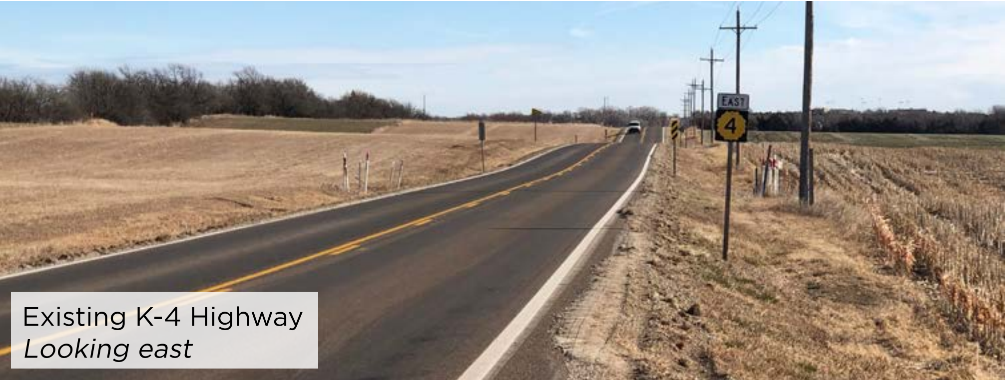
Existing K-4 Highway Looking east