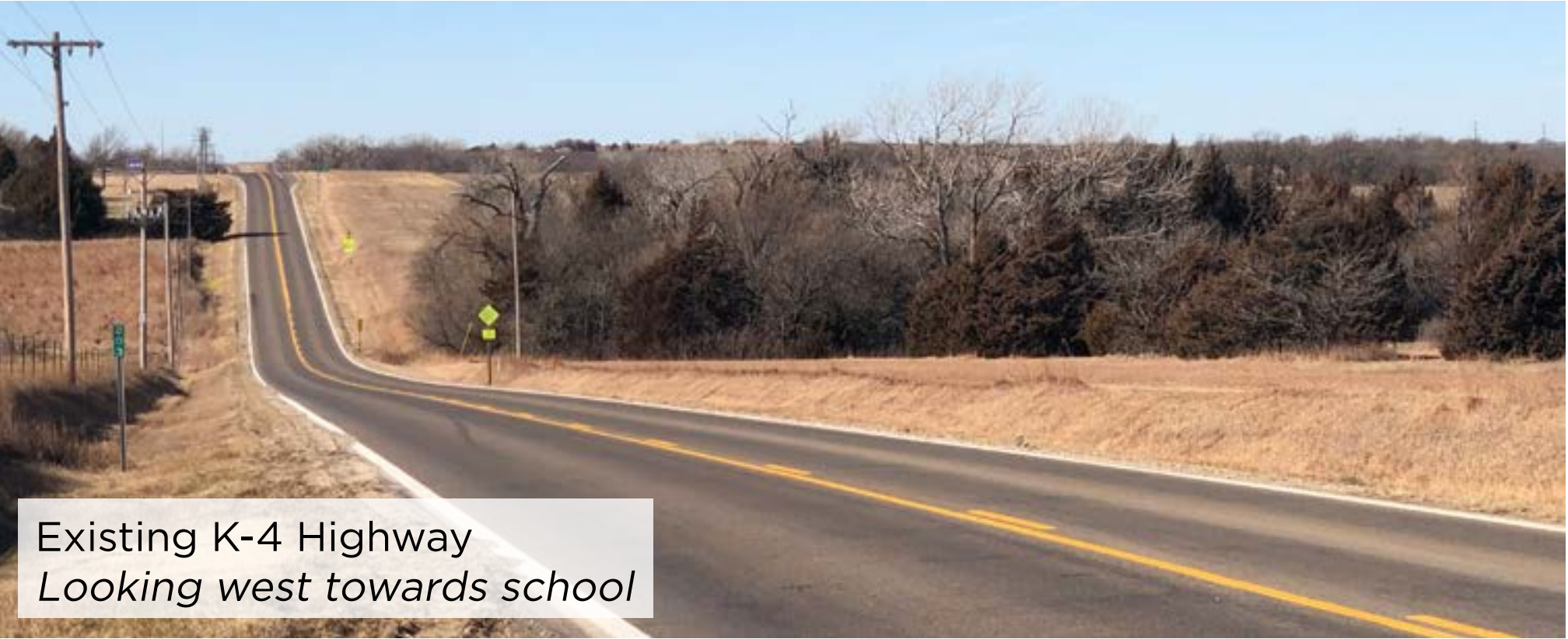
Existing K-4 Highway Looking west towards school