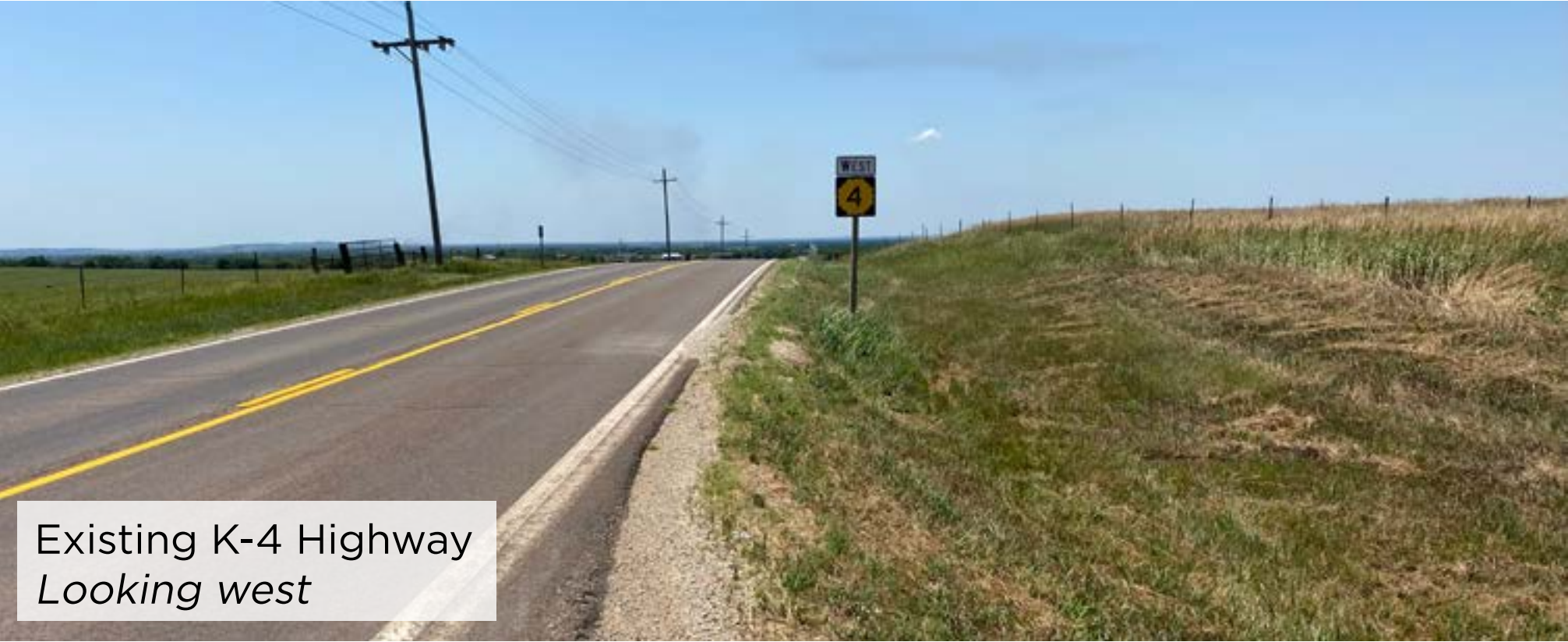
Existing K-4 Highway Looking west