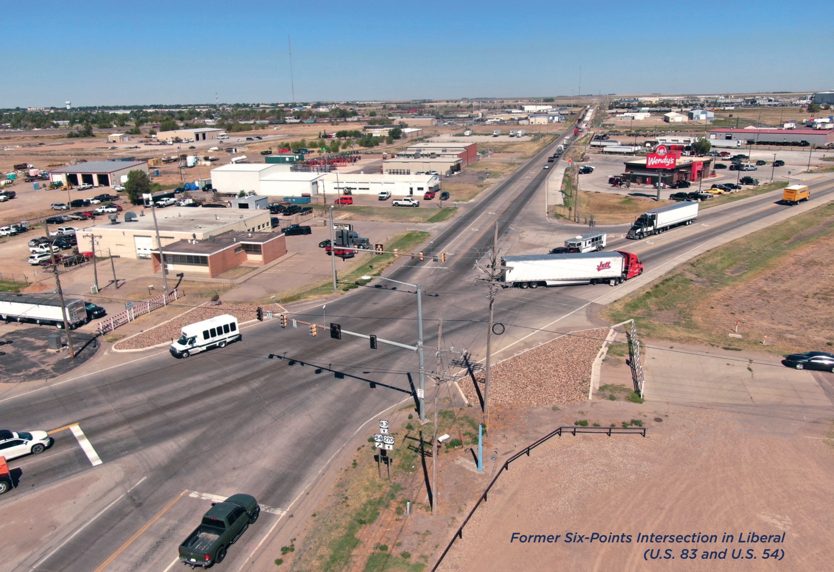
Former Six-Points Intersection in Liberal (U.S. 83 and U.S. 54)

ABOUT IKE IKE—The Eisenhower Legacy Transportation Program—is a roughly $10 billion investment in the future of Kansas. This program and the transportation improvements it will deliver will improve safety, modernize infrastructure and create jobs across Kansas.