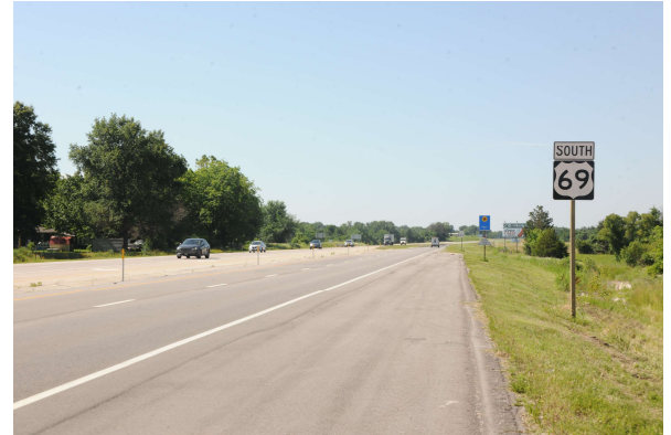
South bound U.S. 69

KDOT initiated this new study in response to interest from surrounding communities. Phase one aims to create an in-depth understanding of the influence the U.S. 69 highway has on the community.