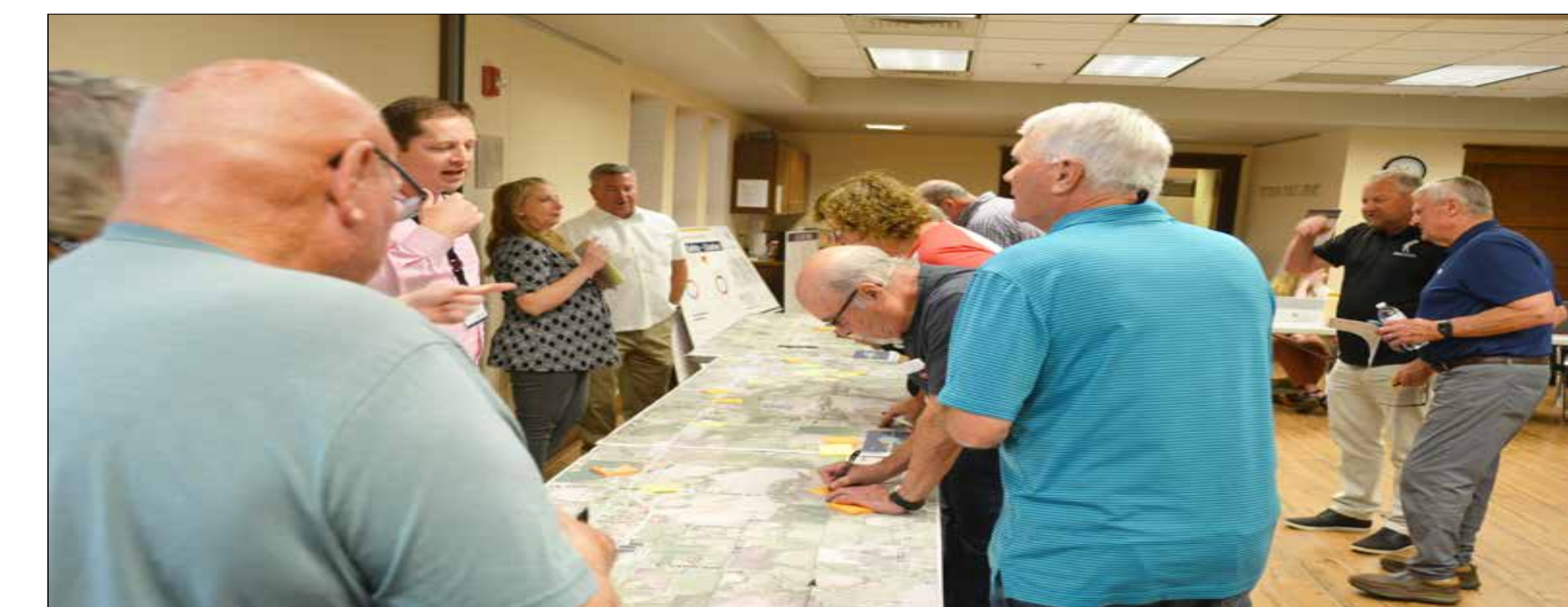
Elected officials from around the county consult a map of the U.S. 69 corridor placing colored notes denoting what is working on the current highway (yellow) and what is not working (orange). Lastly, blue notes indicated locations of possible opportunities for economic expansion.