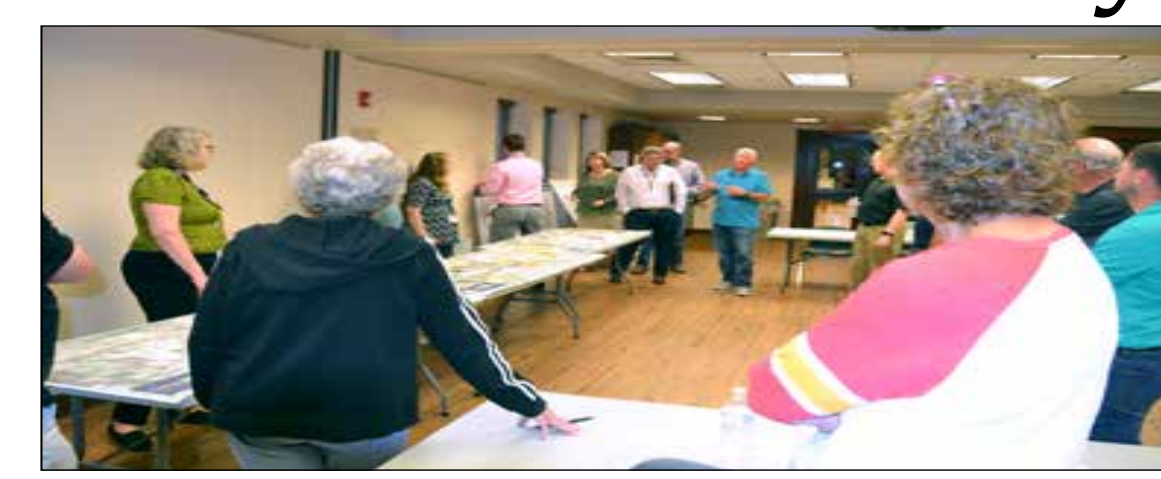
Officials from Pittsburg, Frontenac, and Crawford County engage KDOT representatives about their plans going forward concerning the development of the U.S. 69 corridor, including needed improvements on the existing highway.

KDOT has recently decided to forgo previous plans for the U.S. 69 bypass from Arma through Pittsburg. This year, a new study has been launched to determine the feasibility of improving the existing highway, collecting traffic